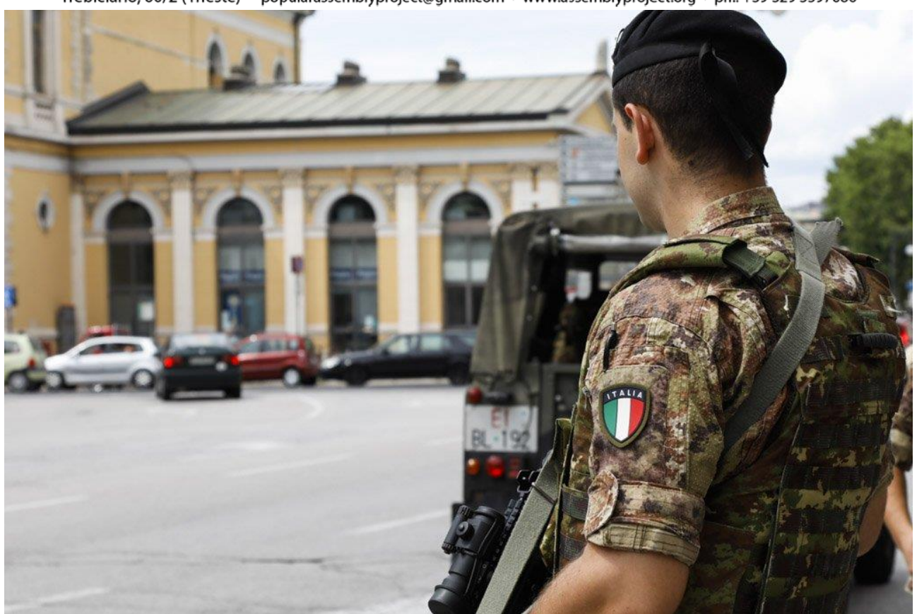
March, 2020 - Piazza della Libertà - Railway Station, Trieste