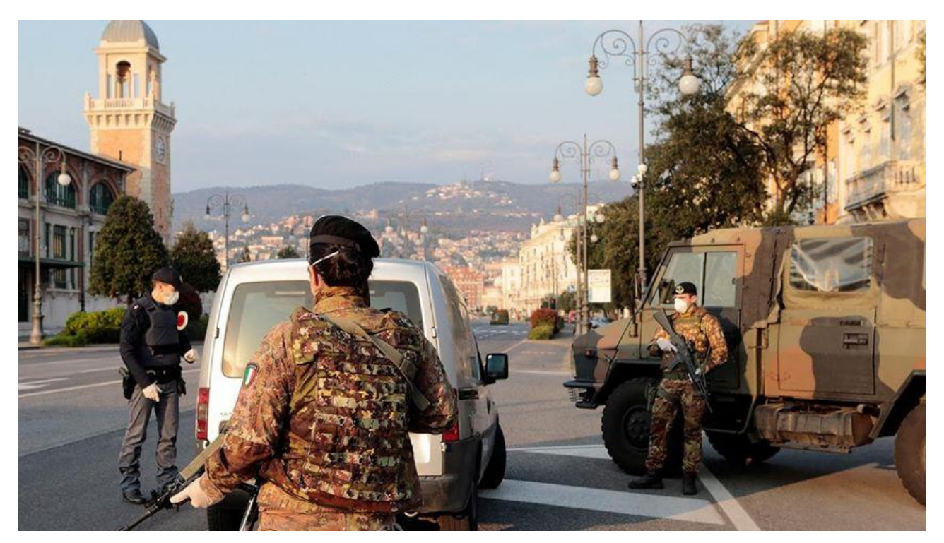
March, 2020 - Downtown area-

\underline{https://www.telefriuli.it/cronaca/militari-esercito-italiano-assegnati-provincia-trieste-controllo-confiniclandestini/2/203843/art/