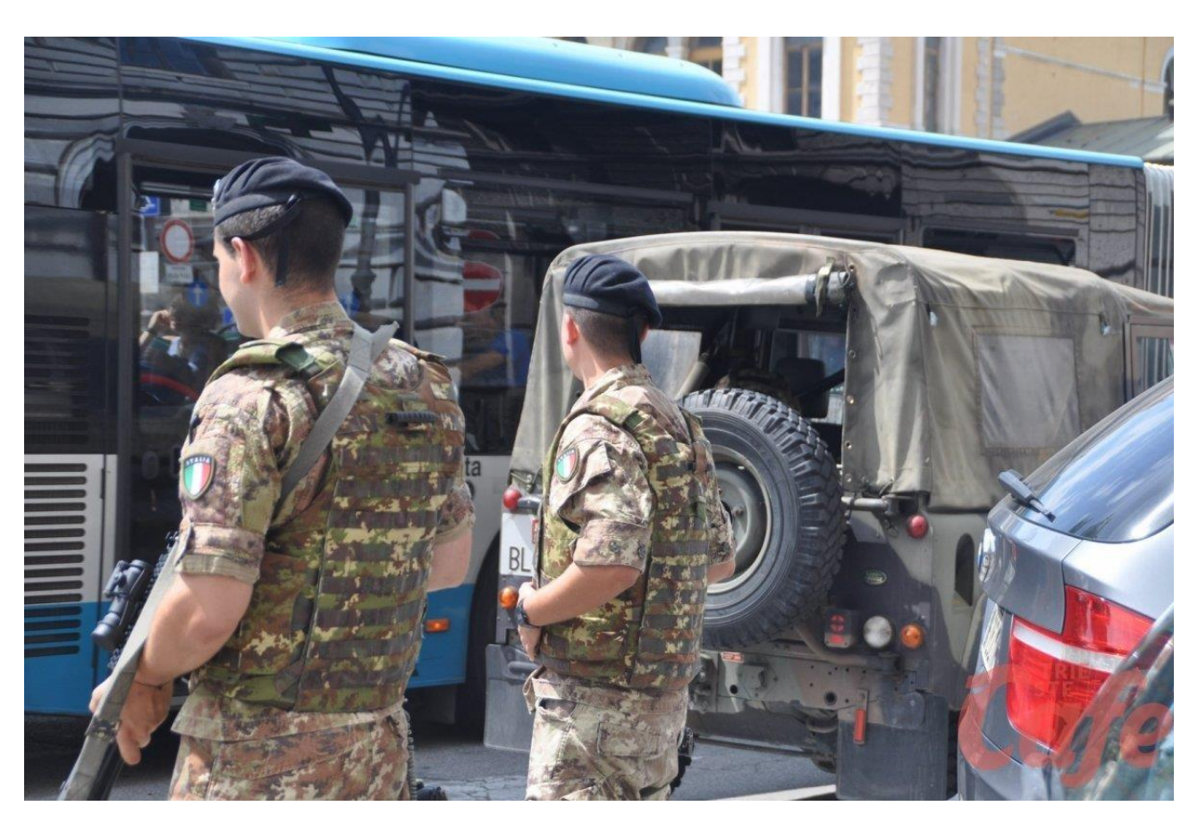
March, 2020 - Piazza della Libertà - Railway Station, Trieste