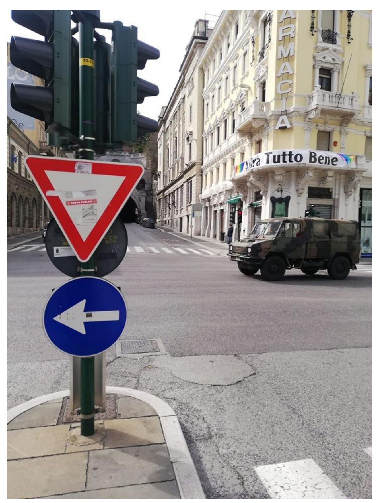
March, 2020 – Piazza Goldoni – neighborhood of the heart of the City, Trieste