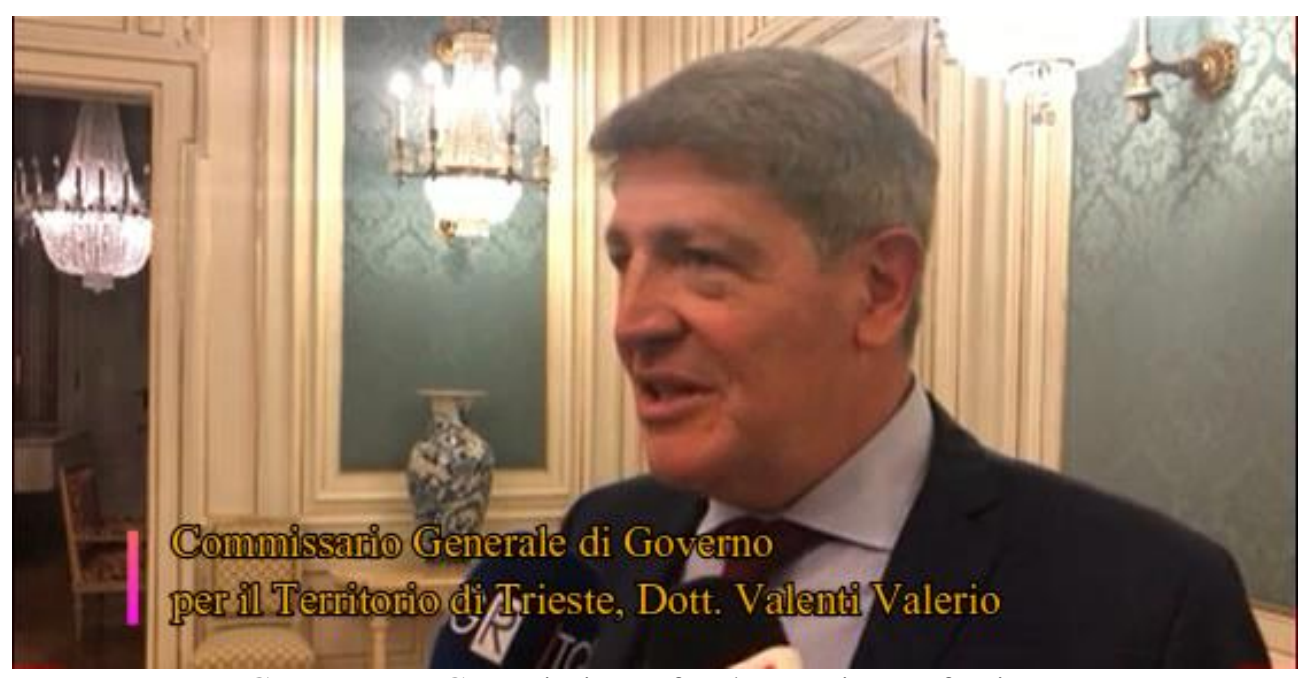
Government Commissioner for the Territory of Trieste